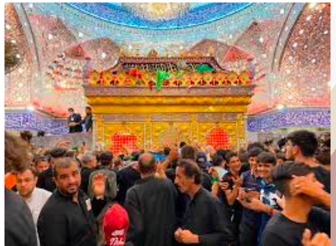
Worshippers gathered inside the holy shrine of Hazrat Abbas (as), in Karbala

The world is drowned in oppression against marginalized groups which include Muslims like you and I. If we can't bring attention to the problems our own people are facing, then what good are we? If we can't speak for the unspoken, how can we be united? If we don't hold up our end and play our part, is there really any point of azadari? We must represent the ideals of Imam Hussain by speaking up for the people of Palestine, Yemen, Kashmir, the Uyghur Muslims, and the Muslimeen all around the world that are oppressed and live in adversity. Shia's speaking up for injustices committed against our brothers and sisters in other lands is the least we can do to follow in the footsteps of Imam Hussain. We must take a stand against the Yazid's of our world today, the Yazid's that are trying to eliminate us for their own selfish reasons. We must take a stand and do what our Moula wants us to.