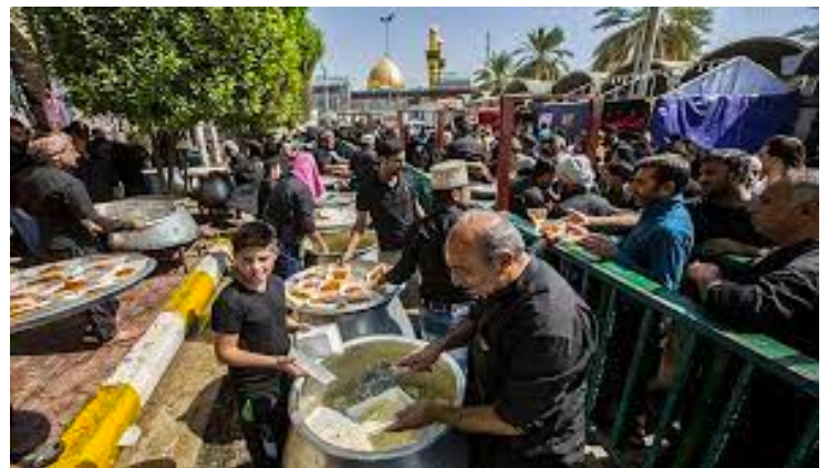
An example of the kindness shown by the local residents towards the pilgrims